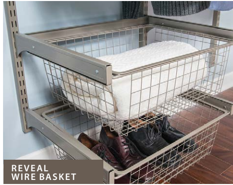
REVEAL WIRE BASKET