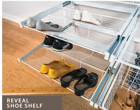
REVEAL SHOE SHELF