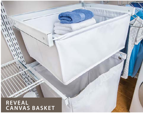
REVEAL CANVAS BASKET