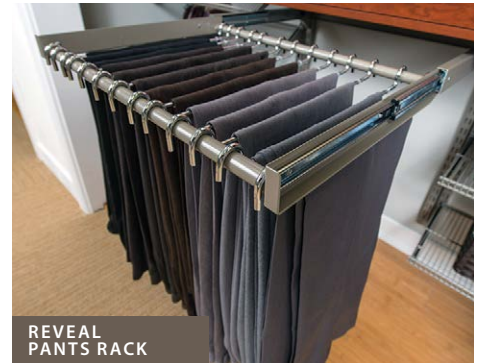
REVEAL PANTS RACK