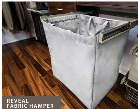
REVEAL FABRIC HAMPER