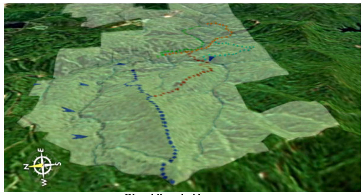
Waterfalls at the blue arrows [click to view]

The cove areas at the lower elevations are very different ecologically from the higher elevations. These areas are generally wetlands or creek flats with an abundance of rhododendron, mountain laurel, hemlock trees and many other flora species. The Wildcat Cove is a wide and flat sandy soil area enclosed by steeply sloped walls. This was a farming area during the pioneer days, and the south end of the cove has a 100-year-old mill and dam site. A number of the early pioneers made their homes in the Wildcat area, which was also the site for many moonshine stills.