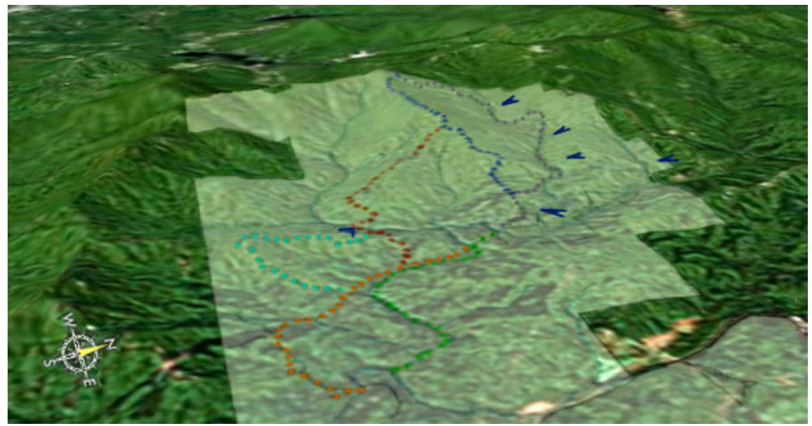
Waterfalls at the blue arrows [click to view]

The Wildcat Creek connecting to the Huckleberry, Fall and Rocky Ford Creeks drains the entire Wildcat Section of the Dawson Forest. This creek joins the Amicalola River in the Wildcat Campground at the site of one of the bridges crossing the Amicalola River.