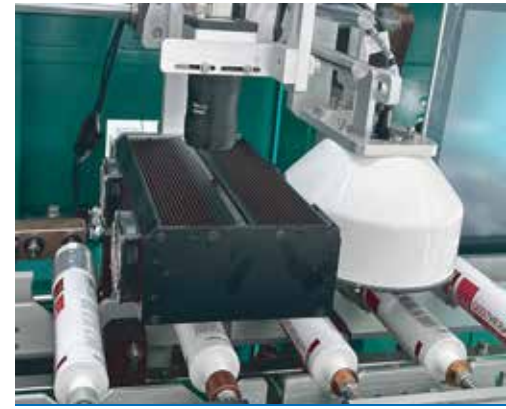
VISUAL INSPECTION MODULE