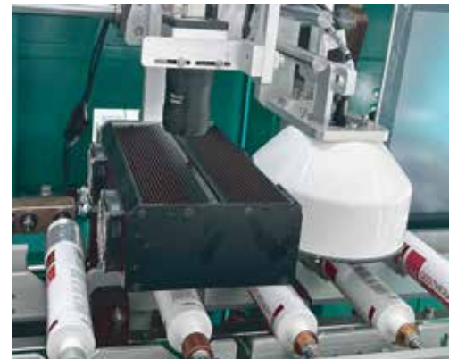
VISUAL INSPECTION MODULE