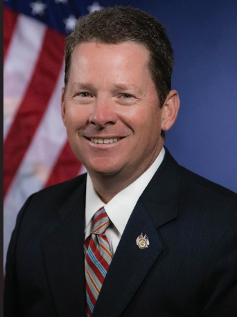
JOSEPH D. BROWN

Former United States Attorney for the Eastern District of Texas (2017-2020) - Appointed by President Donald Trump