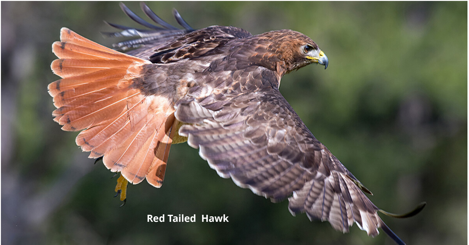
Red Tailed Hawk

If you’ve heard a lot of screeching this summer, it’s likely because hawks were actively nesting or their young were fledging nearby. The adults are especially vigilant and vocal to protect their territory and communicate with each other.