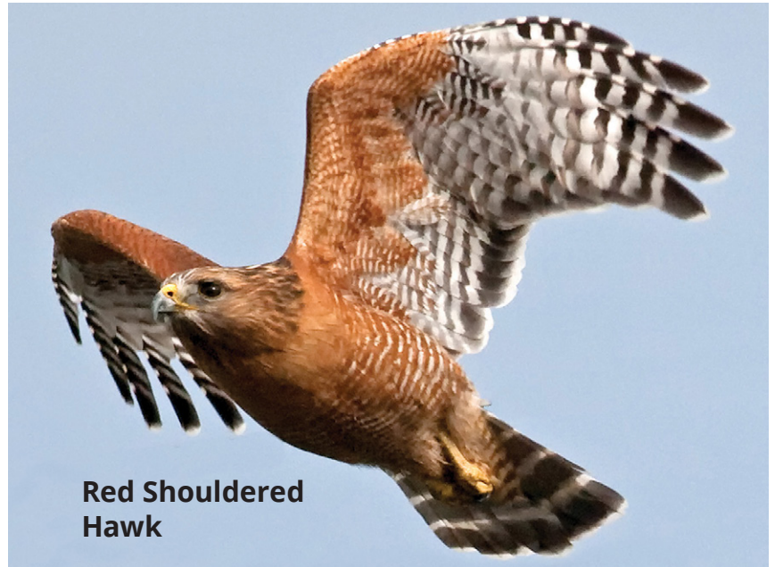
Red Shouldered Hawk

Hawks do not screech to scare prey, but rather to communicate with each other, since they lack the complex songs of other