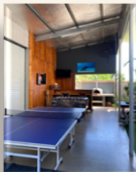
Autumn Port Douglas, FNQ