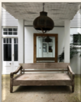
Summer Byron Bay, NSW