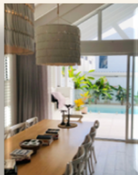
Winter Kingscliff, NSW