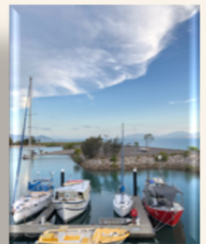
Spring Magnetic Island, FNQ