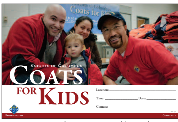
Promotional Poster – Horizontal (#10587)

The Supreme Council offers the below items for order through Supplies Online, the supply ordering portal available on Officers Online.