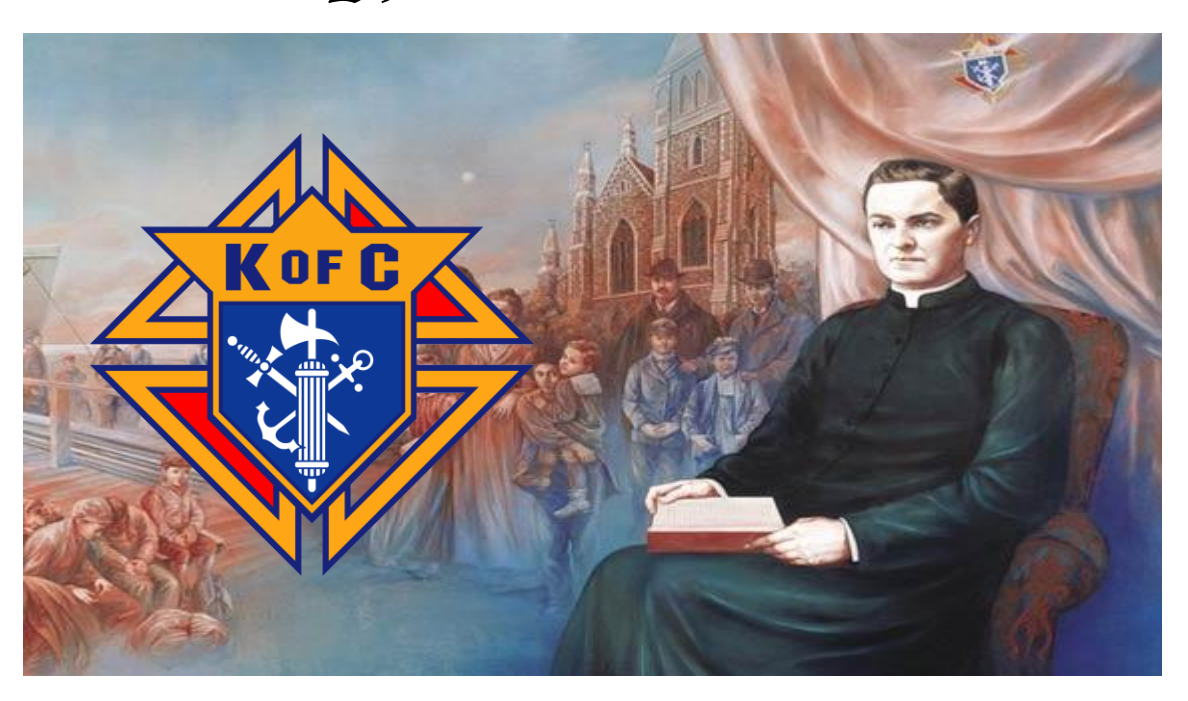
Church Name Council