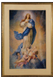
1981-82 Immaculate Conception