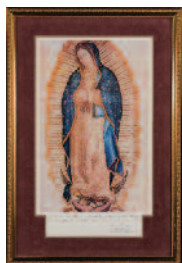
1995-96 Our Lady of Guadalupe