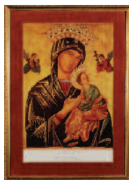
1984-85 Our Lady of Perpetual Help