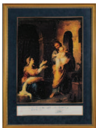
1993-94 Holy Family