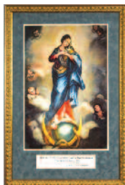
2013-14 Immaculate Conception