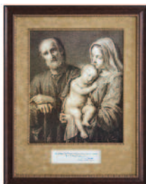
2015-17 Holy Family