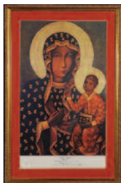
1986-87 Our Lady of Czestochowa