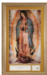
2011-13 Our Lady of Guadalupe