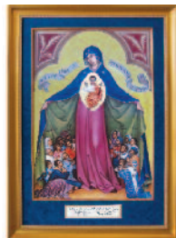
2018-19 Our Lady Help of Persecuted Christians