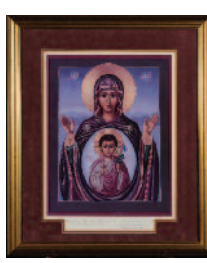
1997-98 Our Lady of the New Advent