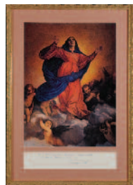
1990-91 Our Lady of the Assumption