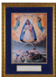
2007-08 Our Lady of Charity