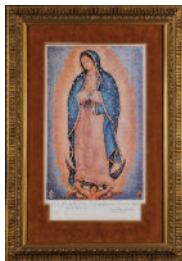
2000-01 Our Lady of Guadalupe