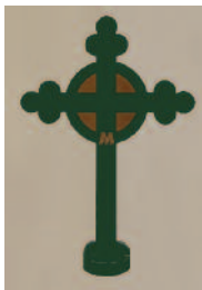
1999-2000 Millennium Cross