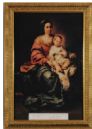
2002-03 Our Lady of the Rosary