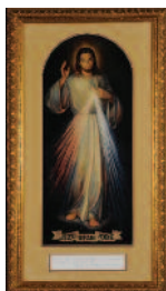
2003-04 Divine Mercy