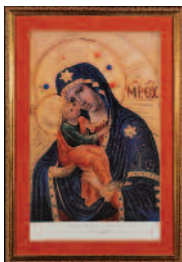
1988-89 Our Lady of Pochaiv