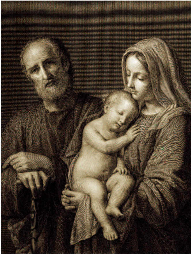
THE HOLY FAMILY

Recognize and support the development of strong families!