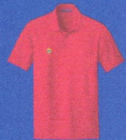
Actual Items Not Shown