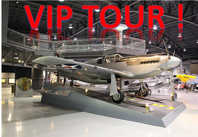
EAA Museum Oshkosh, WI

← EAA Oshkosh Museum Tour with Wisconsin Military Museum Tour.