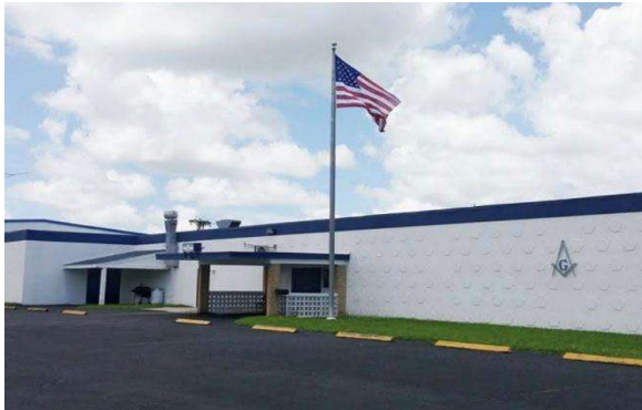
April 2026 Trestleboard