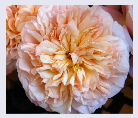
EDITH (Auspluta), Fragrant

Edith is another new David Austin English Garden Rose. She surrounds a golden/peach interior with strawberry guard petals. She is a large rose, with a strong scent and opens up fully into a cup shape. She needs 4-5 days in water to be at the right point for an event.