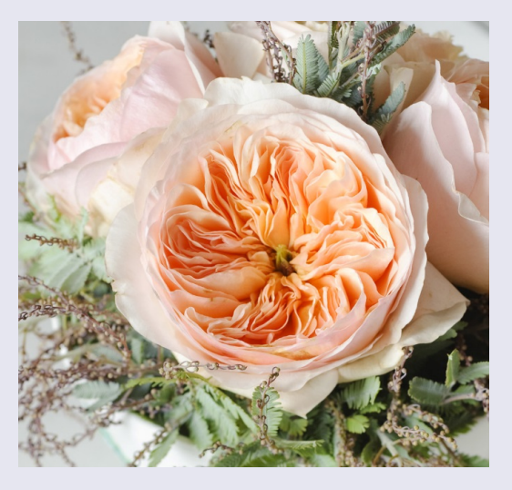
JULIET (Ausjameson), Fragrant

Juliet is a favorite deluxe English garden rose! She has the most romantic and nostalgic shape of all peach roses. She is shy to show her insides at first, but after 3 or 4 days she is celebrating her intimacy and showing you all she has to offer. Juliet has appeared on the cover of more flower magazines than any other rose variety!