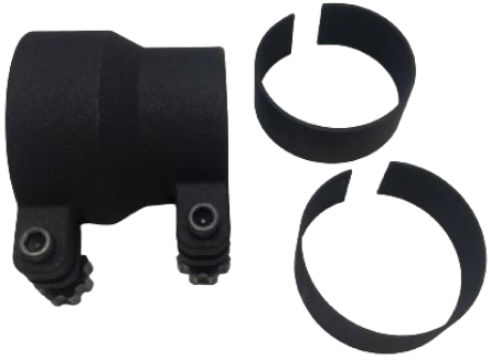
NVSAT Mounted to Leupold Mark 8 20 x 40