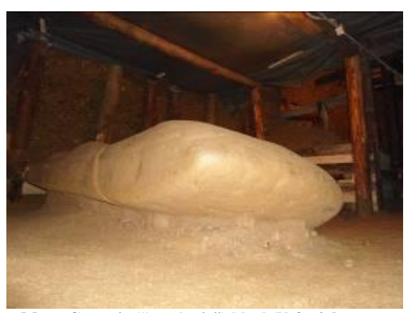
Mega-Ceramic ("synthetic") block K-2, eight tons