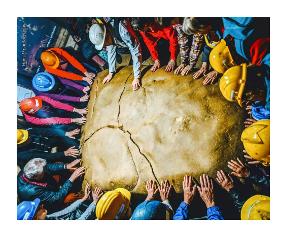
Ceramic, meditation block