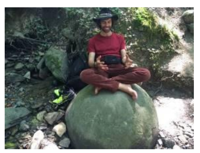
Bosnian Stone Sphere Park in Zavidovici