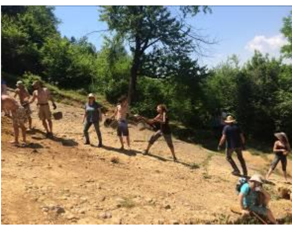
Bosnian Pyramid of the Sun - archaeological dig