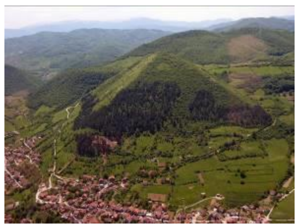
Bosnian Pyramid of the Sun