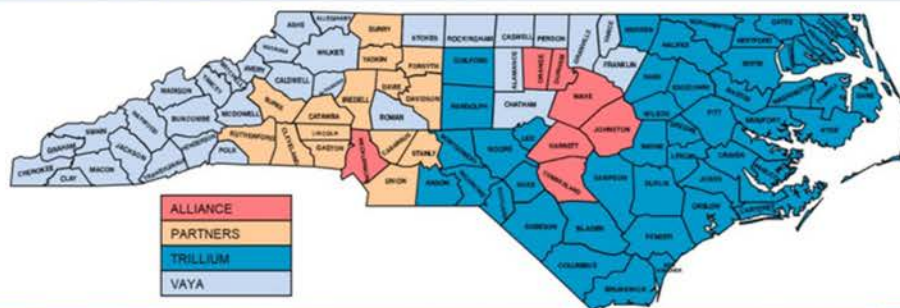
LME/MCO COVERAGE MAP (AS OF FEB.1, 2024)