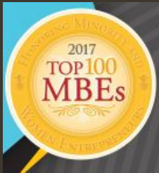
2017 Top 100 MBE