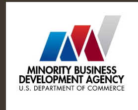
2017 Professional Service Firm of the Year