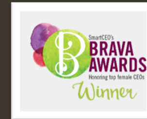
2016 SmartCEO Brava Award