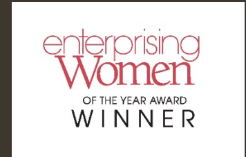
2016 Enterprising Women Of the Year