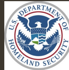
2016 DHS Small Business Achievement Award