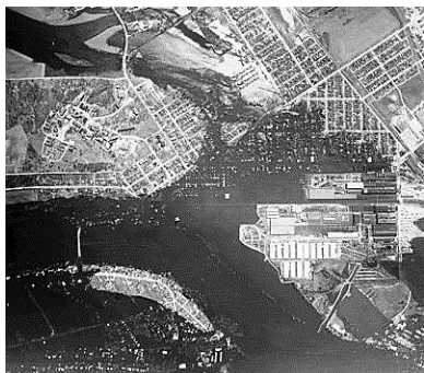
Picture shows Campbells Island (lower left) and Watertown during 1965 flood. The small white specks are roof tops

In 1965, a record flood hit the Quad-City area. One Calvary family displaced by the Mississippi's