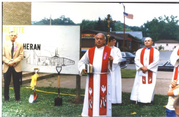
Ground breaking service for new addition – 1987 (names are mentioned above)

Here are some other photos from the 1980s