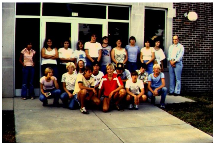
Our Youth Group –on one of their trips Date unknown