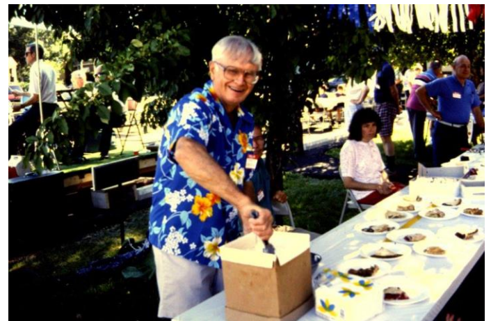
ICE CREAM SOCIAL – 1990s

If you would like to donate, please mail or call the church office at (309)762-5423.