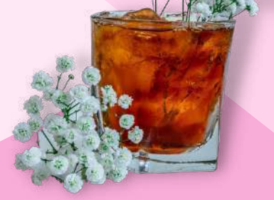
PEEK - A - MULE $15.5 Dolin Sweet. Q ginger beer. Peach purée. Lime. Angostura bitters