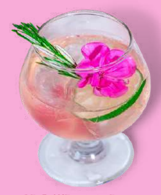
ELDERFLOWER SPRITZER $15.5 Wild Austria Elderflower. Sparkling wine. Thai rose bitters