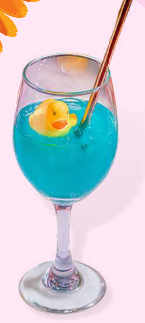
UNDER THE SEA $16.5 Sabe Blanco. Ginger. Vitamin C. Bubbly wine. Mermaid glitters. Ducky friend