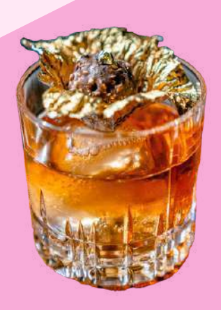
GOLD FASHION $18.5 Sabe Whiskey infused Barrel Aged Spiral. Carpano Antica. Old fashioned bitters. Gold chocolate. 24K Gold