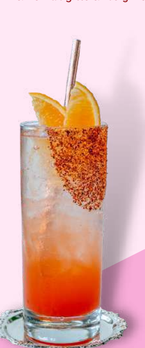
SPICY PALOMA $16.5 Dolin Dry. Cappelletti Aperitivo. Squirt soda. Firewater bitters. Lime. Salt