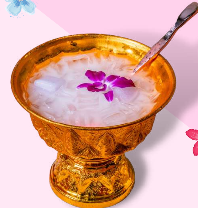
SOCIAL BUTTERFLY $44.5 Family Style Punch Bowl. Brut. Sato unfiltered wine. Passion fruit. Lychee. Umami chili salt