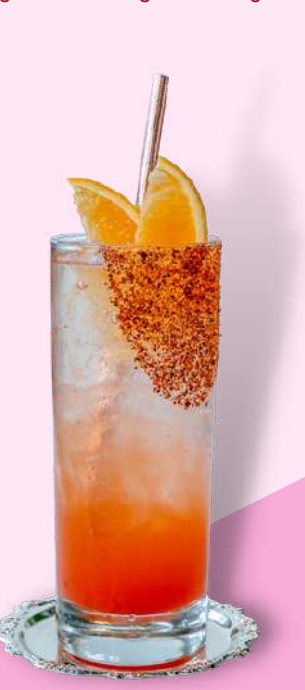
SPICY PALOMA $16.5 Dolin Dry. Cappelletti Aperitivo. Squirt soda. Firewater bitters. Lime. Salt