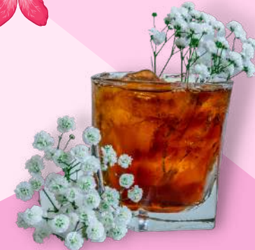
PEEK - A - MULE $15.5 Dolin Sweet. Q ginger beer. Peach purée. Lime. Angostura bitters