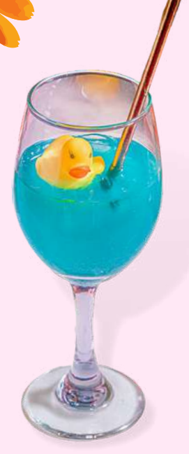
UNDER THE SEA $16.5 Thai chili-infused Soju. Ginger. Vitamin C. Bubbly wine. Mermaid glitters. Ducky friend