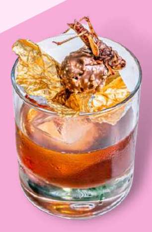
GOLD FASHION $18.5 Korean Soju. Carpano Antica. Old fashioned bitters. Gold chocolate. Fried grasshopper