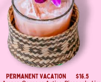
PERMANENT VACATION $16.5 Lofi-Amaro. Carpano Antica. Pineapple. Lime. Coconut cream. Angostura bitters