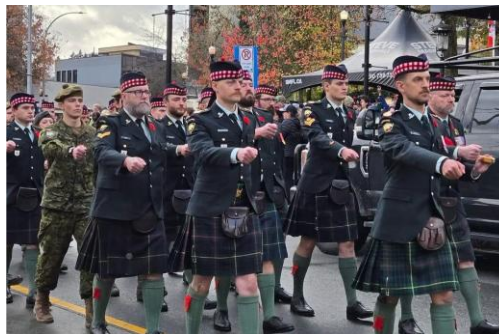
B Company parading through Nanaimo for Scottish Lament

Scottish Scholar 2-24 took place 22-24 Nov 24 and continued the ongoing series of professional development training weekends. In conjunction with Scottish Scholar 2-24, the officers' mess successfully hosted the Game Dinner, with approximately 75 guests in attendance.