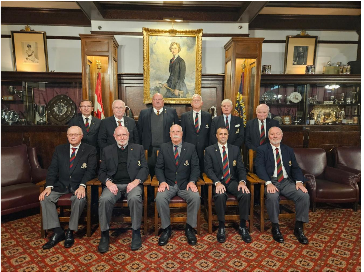
The photo includes some of the Trustees at a recent meeting in the C Scot R Officer's Mess.