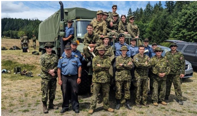
Range Day with Regiment.

2422, 1726, and 136 Sea Cadet Corps (Guest of 2422) participated in a C7 range day in Nanaimo. Senior cadets and corps were in attendance.