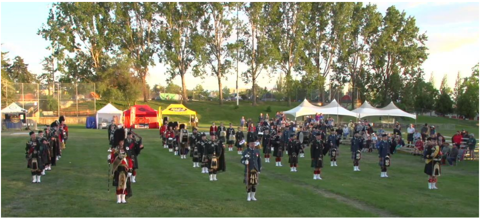
The Massed Pipes and Drums