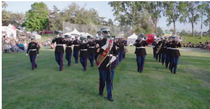
Figure 13rd Marine Air Wing Band

All three visiting bands, as well as the Naden band, joined the Regimental Pipes and Drums to take part in the annual Victoria Day parade.