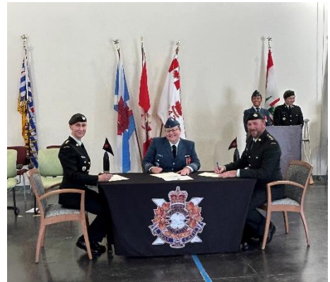
2422 Change of Command parade.

2422, 1726, and 136 Sea Cadet Corps (Guest of 2422) participated in a C7 range day in Nanaimo. Senior cadets and corps were in attendance.