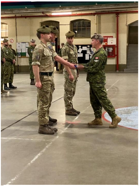
CO Presenting the camp flag to 6 SCOTS