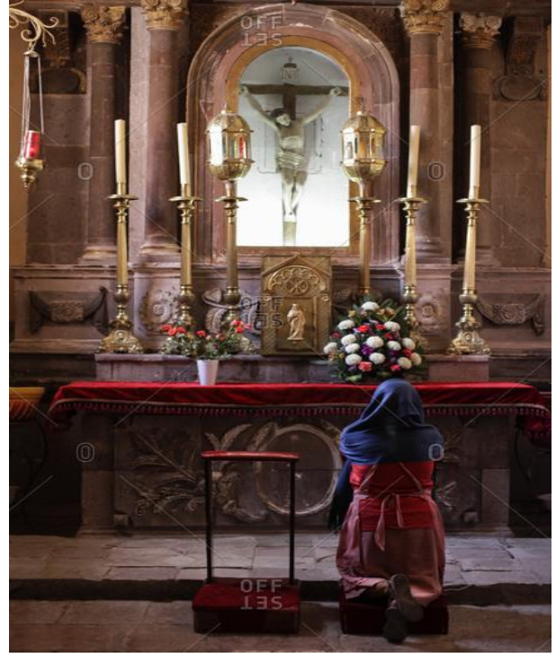
Please keep in your prayers Brother Knights and their families who are experiencing health problems and ask the Lord to extend his Blessings to them.

In addition to the above training, the following officers must be trained on the KofC.org web site. GRAND KNIGHT, PROGRAM DIRECTOR, FAMILY DIRECTOR AND COMMUNITY DIRECTOR. Each of these officers will receive an email from supreme with specific instructions. If you fail to take the training within 30 days of receiving the email, supreme will automatically drop you from that director position. Thus far, the only position not cleared is COMMUNITY.