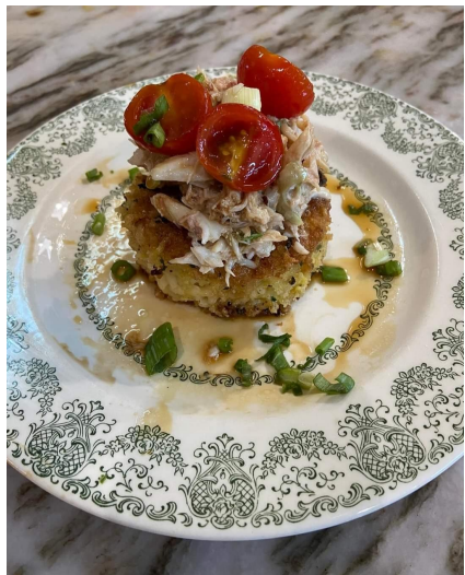
POWER TOWER: PARM CRUSTED RISOTTO CAKE, CRAB SALAD, MIRIN SOAKED TOMATOES, & TERIYAKI NORI