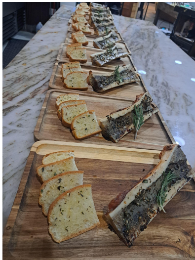
ROSEMARY ROASTED BONE MALLOW WITH SUN DRIED TOMATO CROSTINI