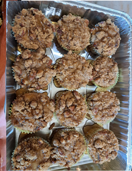
BANANA FOSTER MINI CAKES WITH STREUSEL