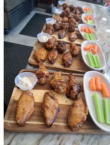
SMOKED RUBBY CHICKEN DUBBY WINGS WITH CREAMY GARLIC DIP