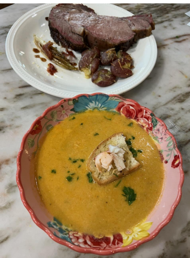
TWO DISHES: LOBSTER & SNOW CRAB BISQUE / ROASTED KUNE KUNE PORK, CHAMPAGNE BRAISED BRUSSELS & GRILLED ENDIVE SALAD