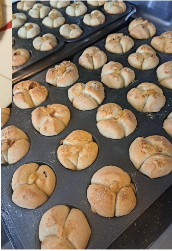
GARLIC STUFFED CLOVER ROLLS