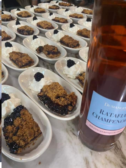
BLACKBERRY CRUMB BAR