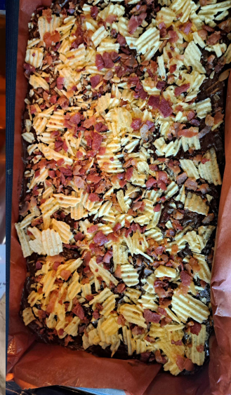
BACON POTATO CHIP BROWNIES