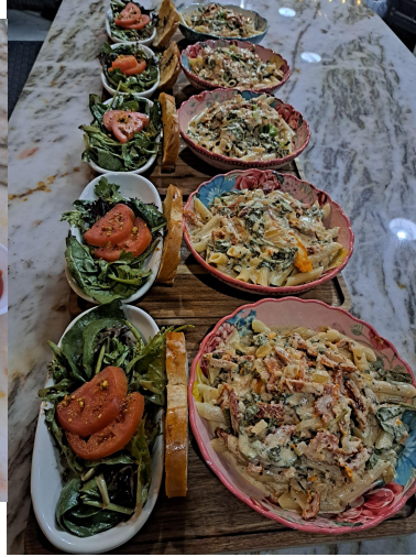
CREAMY TUSCAN CHICKEN PASTA, MIXED GREENS & HOUSE CREAMY BALSAMIC