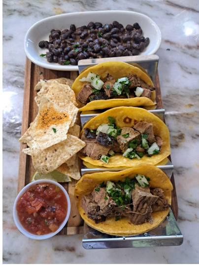
TACO TRIO CARNE ASADA, SMOKY CHIPOTLE CHICKEN, & GARLIC BUTTER SHRIMP