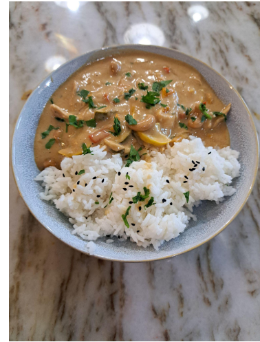
SESAME- TAHINI CASHEW COCONUT CHICKEN WITH JASMINE RICE