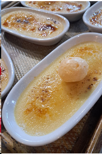
BURBON HONEY CREME BRULEE