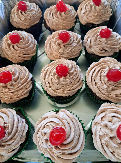
BLACK FOREST CUPCAKES