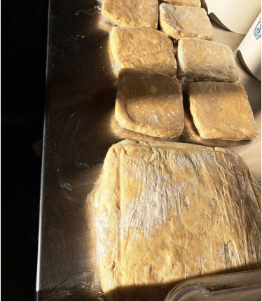
PB & JELLY GALETTE