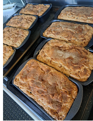
CINNAMON CHIP SNICKERDOODLE BREAD