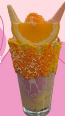
ORANGE YOU FUN?