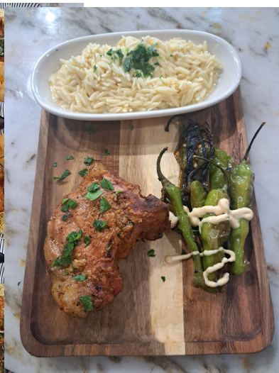
CRISPY PORK CHOP, ORZO DIAVOLO, BLISTERED SHISHITOS WITH TRUFFLE HABANERO AIOLI