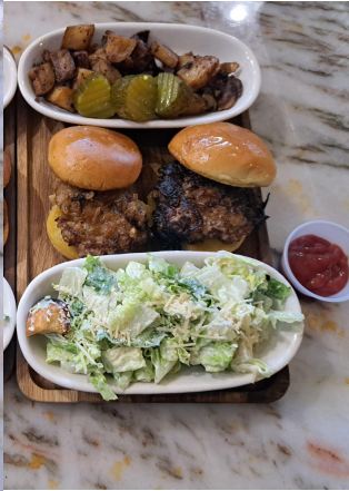
OKLAHOMA ONION SMASH BURGER SLIDERS, HOUSE MADE CESAR & ROASTED ROSEMARY POTATOES