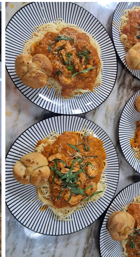
CAPELLINI POMODORO WITH BUTTER POACHED SHRIMP