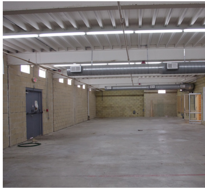
3,080 SF annex with outside fenced in area