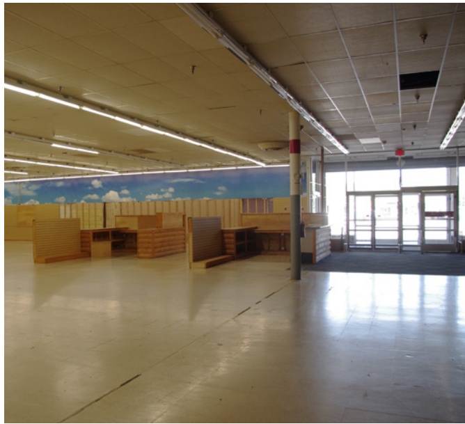
Exceptionally clean space with high ceilings

Bainbridge Twp. (Chagrin Falls), Ohio 44023