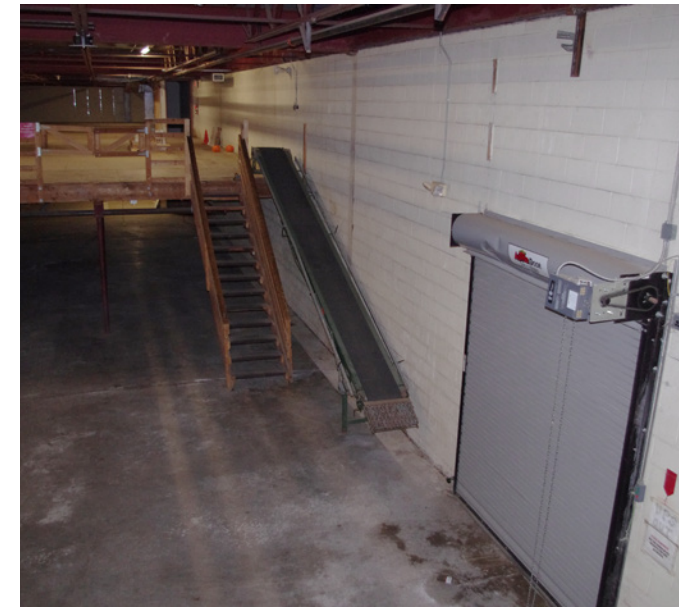
Elevated mezzanine in rear delivery area