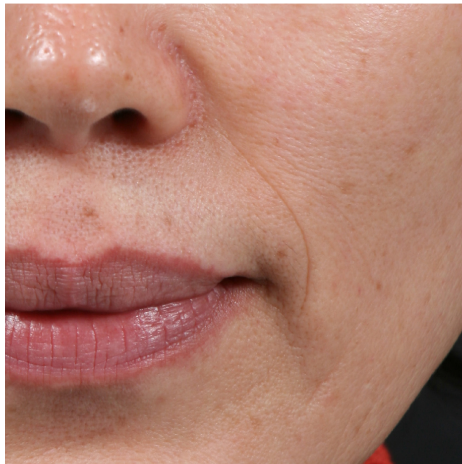
Before & after 1 treatment