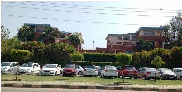
Strawberry Fields School (Chandigarh)