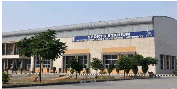
Gamada Sports Complex (Mohali)