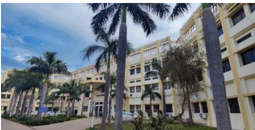
Baddi University (Baddi)