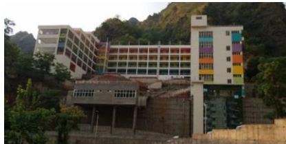
Akal Academy (Baru Sahib HP)