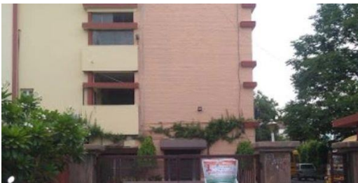
D C Model School (Panchkula)