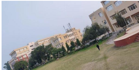
Chitkara University (Rajpura & Baddi)