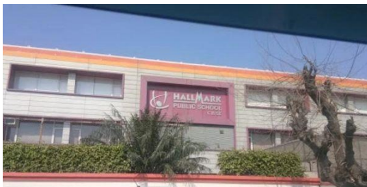
Halmark School (Panchkula)