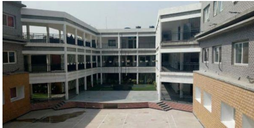
St. Soldier Public School (Panchkula)