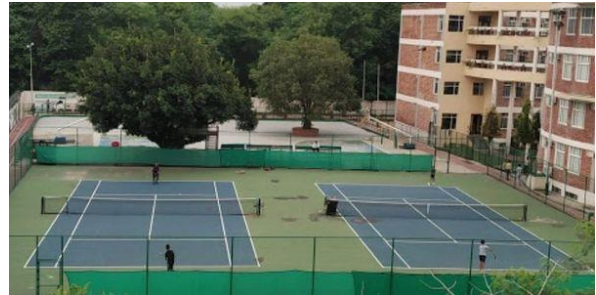
Chitkara International School (Chandigarh)