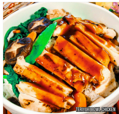
TERIYAKI BOWL CHICKEN