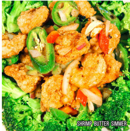
SHRIMP BUTTER SIMMER