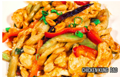
CHICKEN KUNG PAO