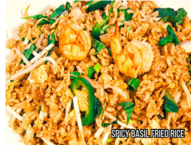
SPICY BASIL FRIED RICE