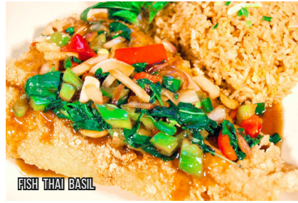
FISH THAI BASIL