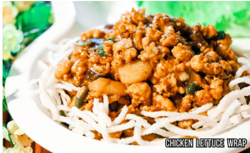
CHICKEN LETTUCE WRAP