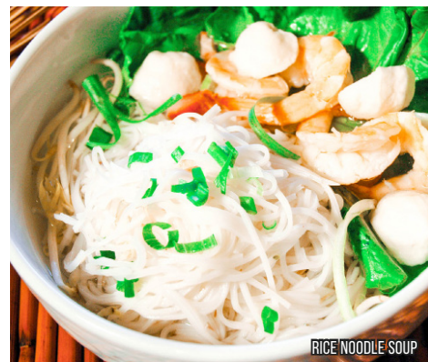
RICE NOODLE SOUP