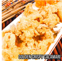
GOLDEN CRISPY CALAMARI