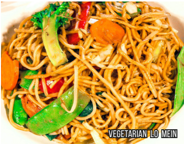
VEGETARIAN LO MEIN