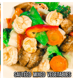
SAUTÉED MIXED VEGETABLES