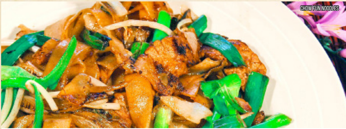
CHOW FUN NOODLES