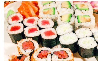
* COOKED ROLL