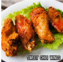
SWEET CHILI WINGS