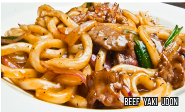
BEEF YAKI UDON