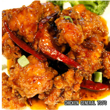
CHICKEN GENERAL TSO'S