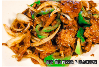
BEEF BELLPEPPER & BLACKBEAN