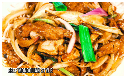
BEEF MONGOLIAN STYLE