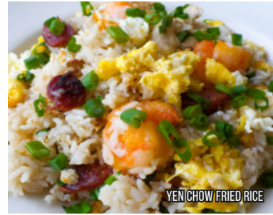
YEN CHOW FRIED RICE