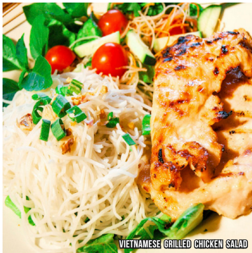
VIETNAMESE GRILLED CHICKEN SALAD