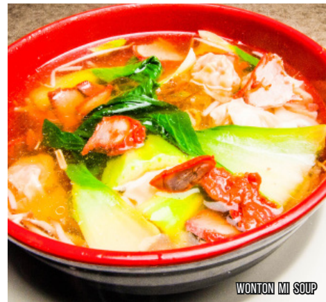
WONTON MI SOUP