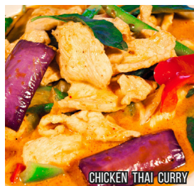
CHICKEN THAI CURRY