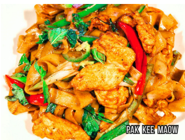
PAK KEE MAOW