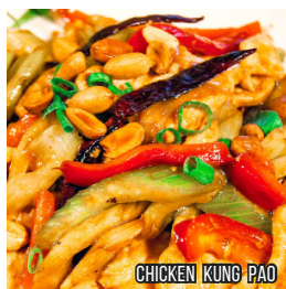
CHICKEN KUNG PAO