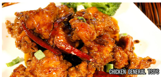
CHICKEN GENERAL TSO'S