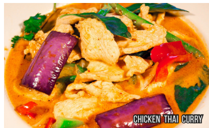
CHICKEN THAI CURRY