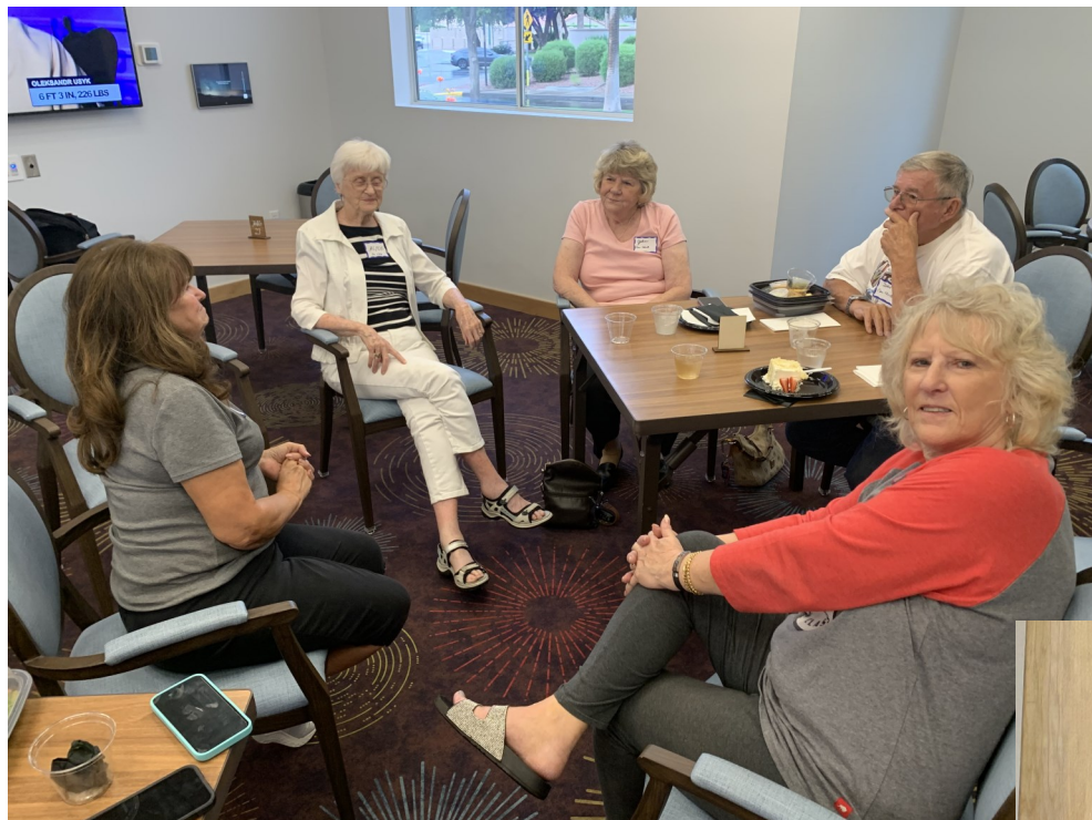
The Birthday Boy enjoying some yummy cake and some great conversation with friends & family!