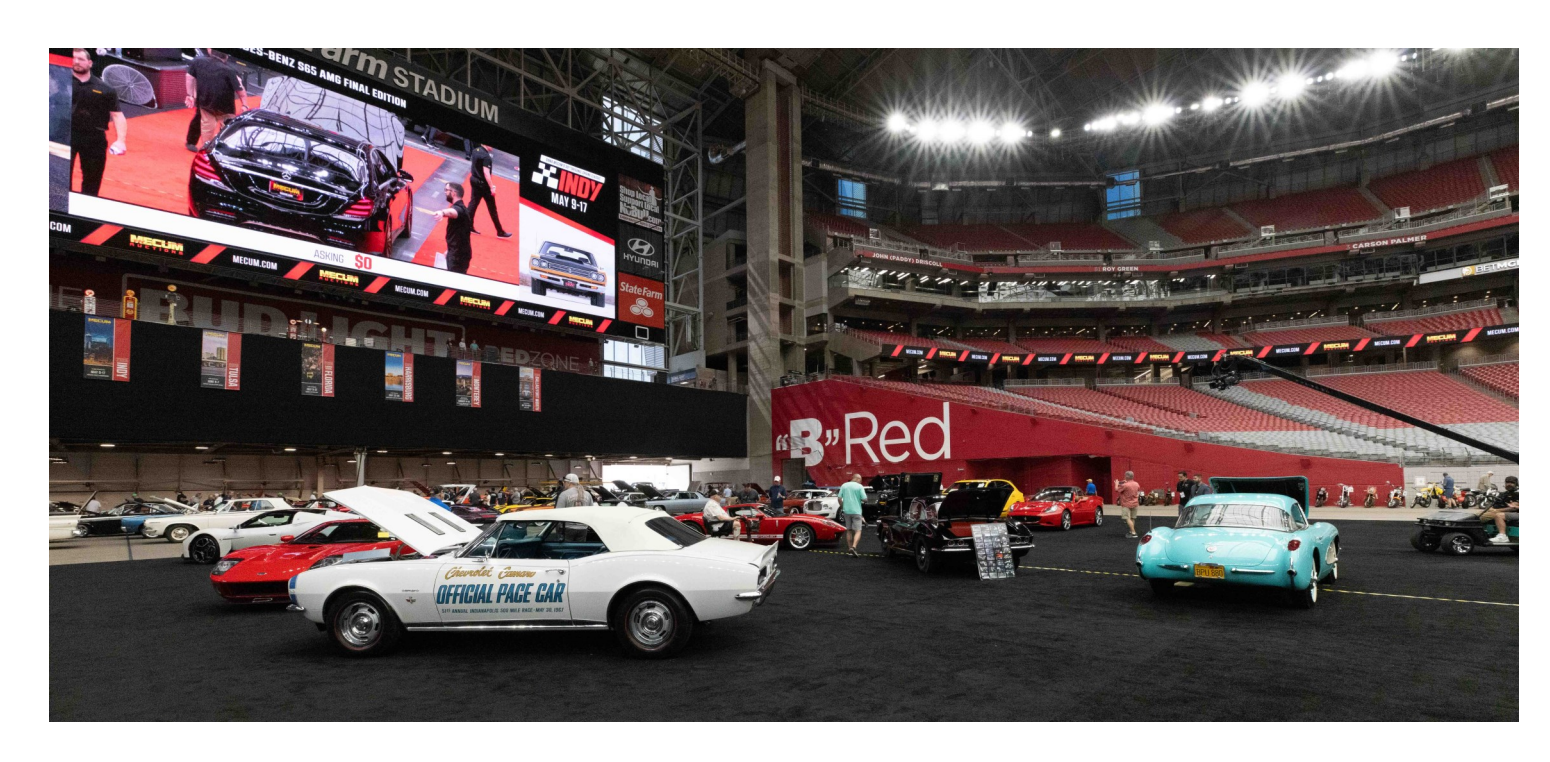
Some of Greg's favorites.