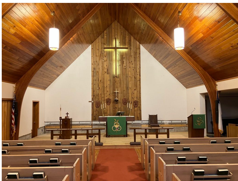
Various configurations of the chancel furnishings were considered with the flat floor during the remodeling.

✚ Council has discussed preparing lists of short-term and long-term property improvement needs and desires.