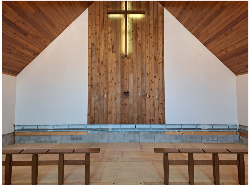
The flat platform after the additional levels were removed. Notice that the heating radiators had not yet been removed.

✚ We have discussed painting the fellowship hall and are hoping to be able to complete that this year with volunteer labor.