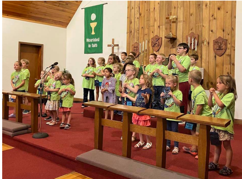
2025 Vacation Bible School

music store in Rapid City is no longer in business and the nearest dealers are a day's drive away (with a service call and mileage cost of about $1,000). We had a repairman come from the dealer in Grand Forks, North Dakota, but the organ did not show the problem while he was here. We continue to try to diagnose the problem as we think it should be repairable. There has been some talk of looking for a new organ, but a new organ is an expensive solution to what may be a minor problem. One salesman suggested that given the distances involved, the age of the current organ, and the advances in organ technology, purchasing a new organ might be the best option.