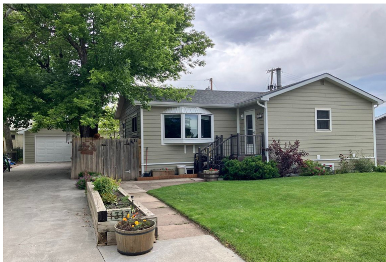
Parsonage in 2025 with the new siding and new steps that were installed in 2024.

✝ The council authorized the purchase of a Bluetooth system that would enable people to listen to the church audio through their cell phones and Bluetooth hearing aids. After getting the product, the dealer is unsure that such a system will work for us.