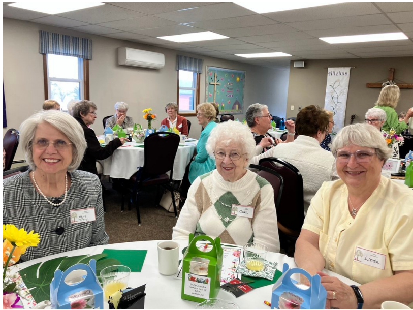
2025 Spring Women's Tea hosted by the Immanuel Lutheran Church Women.

In December we packed Goodie boxes that were given as a special remembrance at Christmas to 12 people.