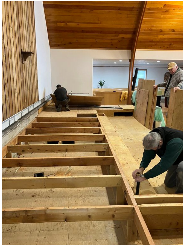
Removing the platforms

Remodeling the chancel to remove the various levels. The platform under the altar was removed and reused but carpeted separately to allow it to be removed. The additional levels were eliminated.