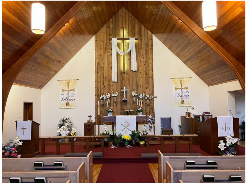
Easter 2025 with newly remodeled chancel and new banners

✝ Wednesday Lenten services in 2025 focused on the Ten Commandments using Luther's Small Catechism. This year they will focus on the Sacraments.