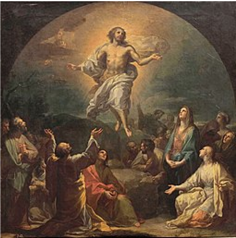
The Ascension of the Lord by Francisco Bayeu (1734-1795)

6. Crown him the Lord of years, The potentate of time, Creator of the rolling spheres, Ineffably sublime. All hail, Redeemer, hail! For thou hast died for me; Thy praise and glory shall not fail Throughout eternity.