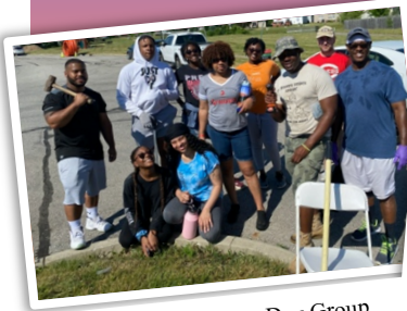
Community Clean-Up Day Group