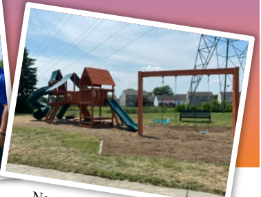
New weed mat and playground mulch.