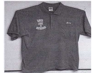
Official Danish Brotherhood shirts are available from Super Sports on 80th Street in Kenosha.