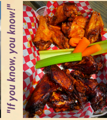
"If you know, you know!"

"Life begins at the end of your comfort zone." --Neale Donald Walsch