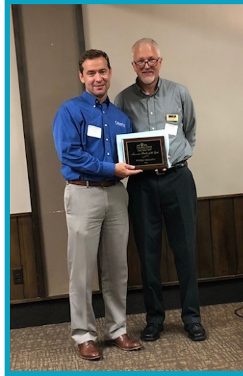
Associate of the Year