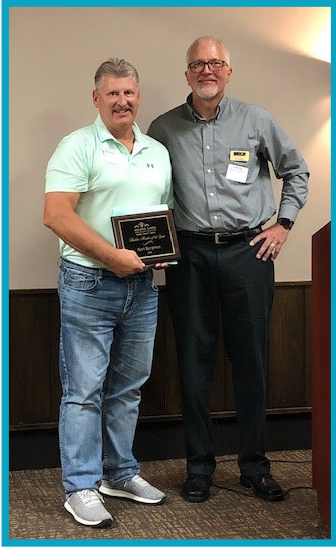
Builder of the Year

Congratulations to everyone that received an award and thank you for all you do for the Association!