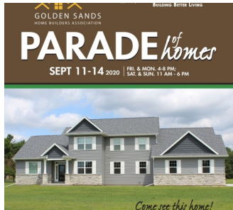
Parade of Homes