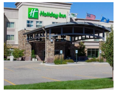
Home Show 2021