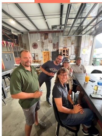
Bloody Mary Specials