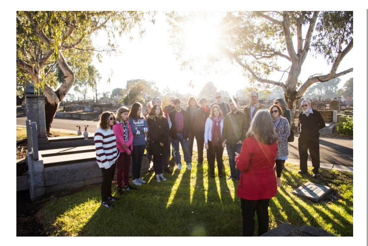
Enjoying a tour at Coburg Cemetery.

You can reach us by emailing us at <a href="mailto:focc.group@gmail.com">focc.group@gmail.com</a>