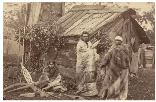
Coranderrk c 1883-NGV