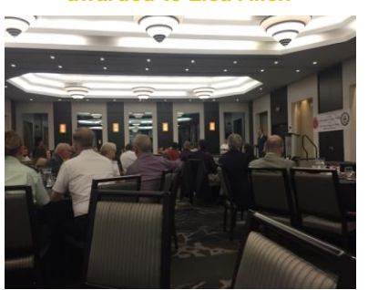
DON'T MISS IT! NEXT AGM APRIL 5<sup>TH</sup>, 6<sup>TH</sup>, AND 7<sup>TH</sup> 2019