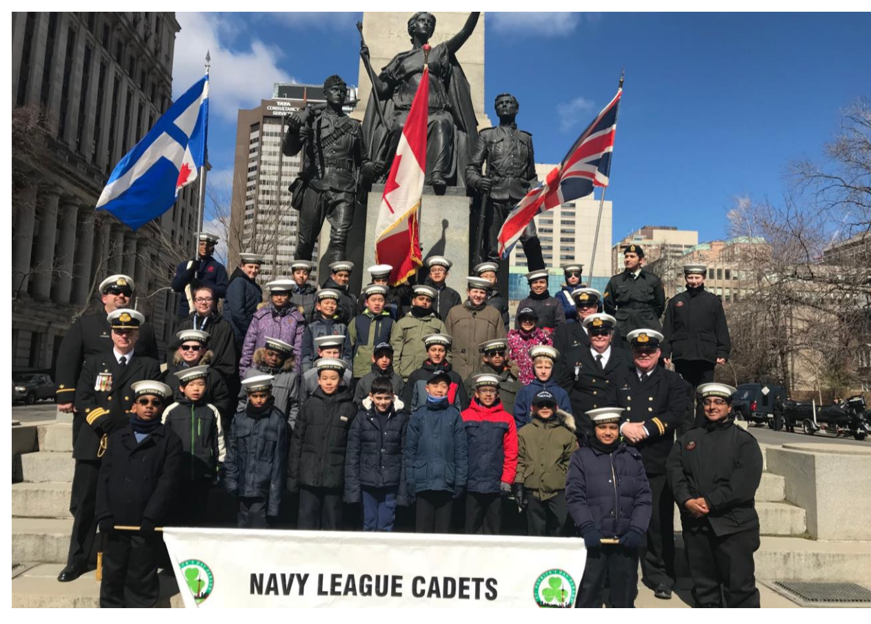
Cadets from, NLCC ARK ROYAL (East York), NLCC PRINCE OF WALES (Scarborough) represented Navy League Cadets in the Toronto 2018 St Patrick's Day Parade in downtown Toronto on March 11th.