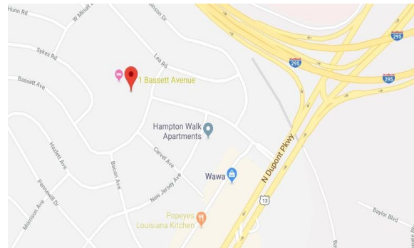
Conveniently located near the Route 13 and I 295 interchange