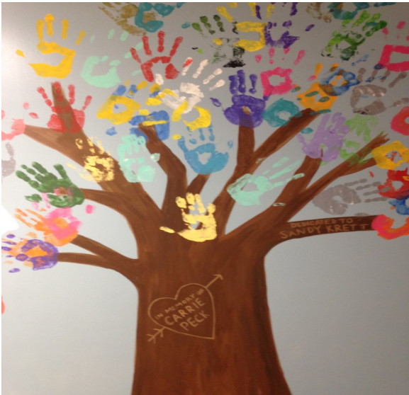
Collaborative artwork by our seniors