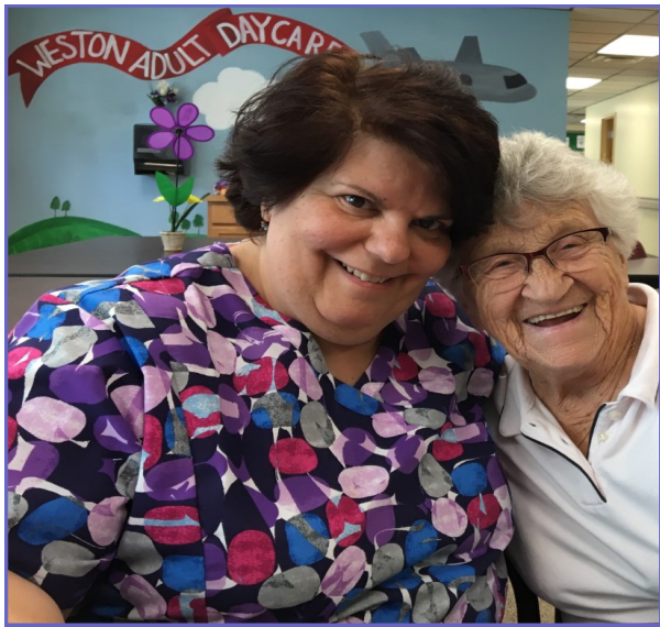
Serving the community since 2005