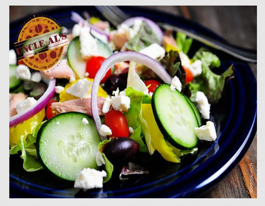
Garden fresh salads