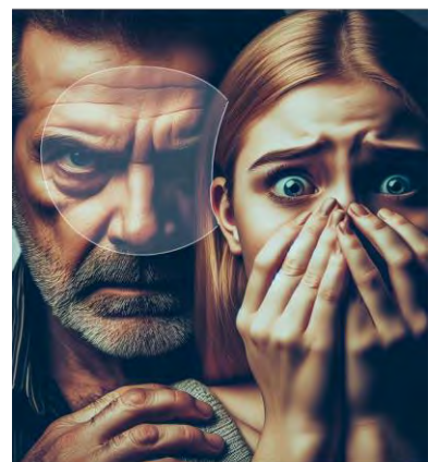
UPDATE: MAY 2024

If 200 yard range is not available, stages 7-8 may be shot on a 100 yard range on the reduced target sheet.