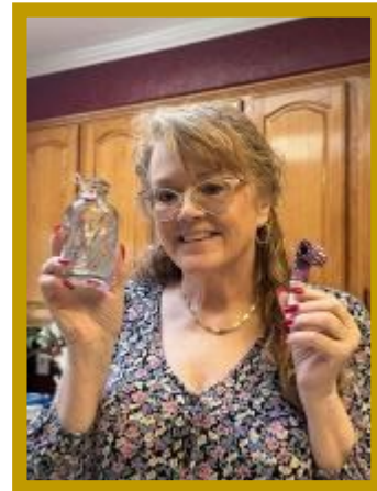
Girls just want to have fun.