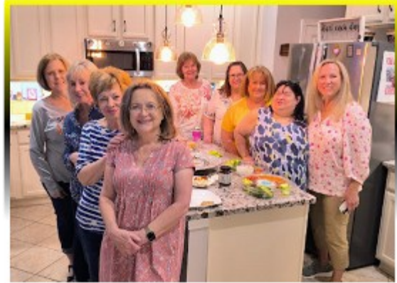
The fabulous ladies of XAZ