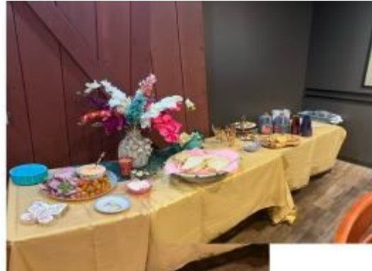
Table sporting Spiral Ham slices, cherry tomatoes, sour dough bread, condiments of mayo, mustard, incldg. gourmet pickles, bowl of chips, large plate of gourmet bread shaped as hearts, gourmet cookies, gourmet jellybeans, sweet & unsweet tea, ice, cups, plates, napkins (luncheon & cocktail) and flatware.

Our Friendly Ventures Chairman, Shawn Dorn arranging the game & drawing prizes upon the reception table around the name tags for our invited guests.