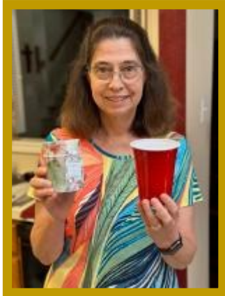
Some of the Solo Cup Olympics' Medalists